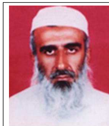
Molavi Ahmad Sayyad, found dead after being arrested by Iranian security forces in 1997

For many years, the east of the country has had a heavy military presence. This increased further after the “Tasuki incident” (see above). A small force known as Mersad (Ambush), which has reportedly been based in Kerman province since 1995 to counter drug-smuggling, 75 was expanded into a joint operational unit of various security forces with a base