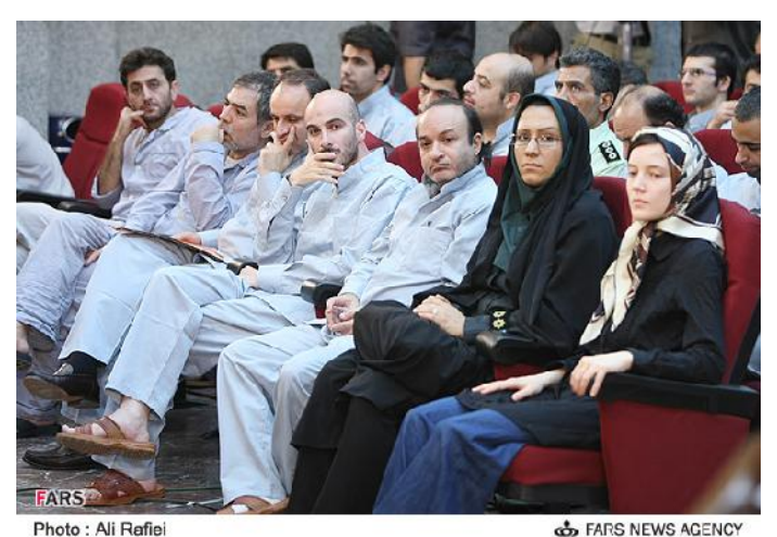
Mass trial in Tehran, August 2009