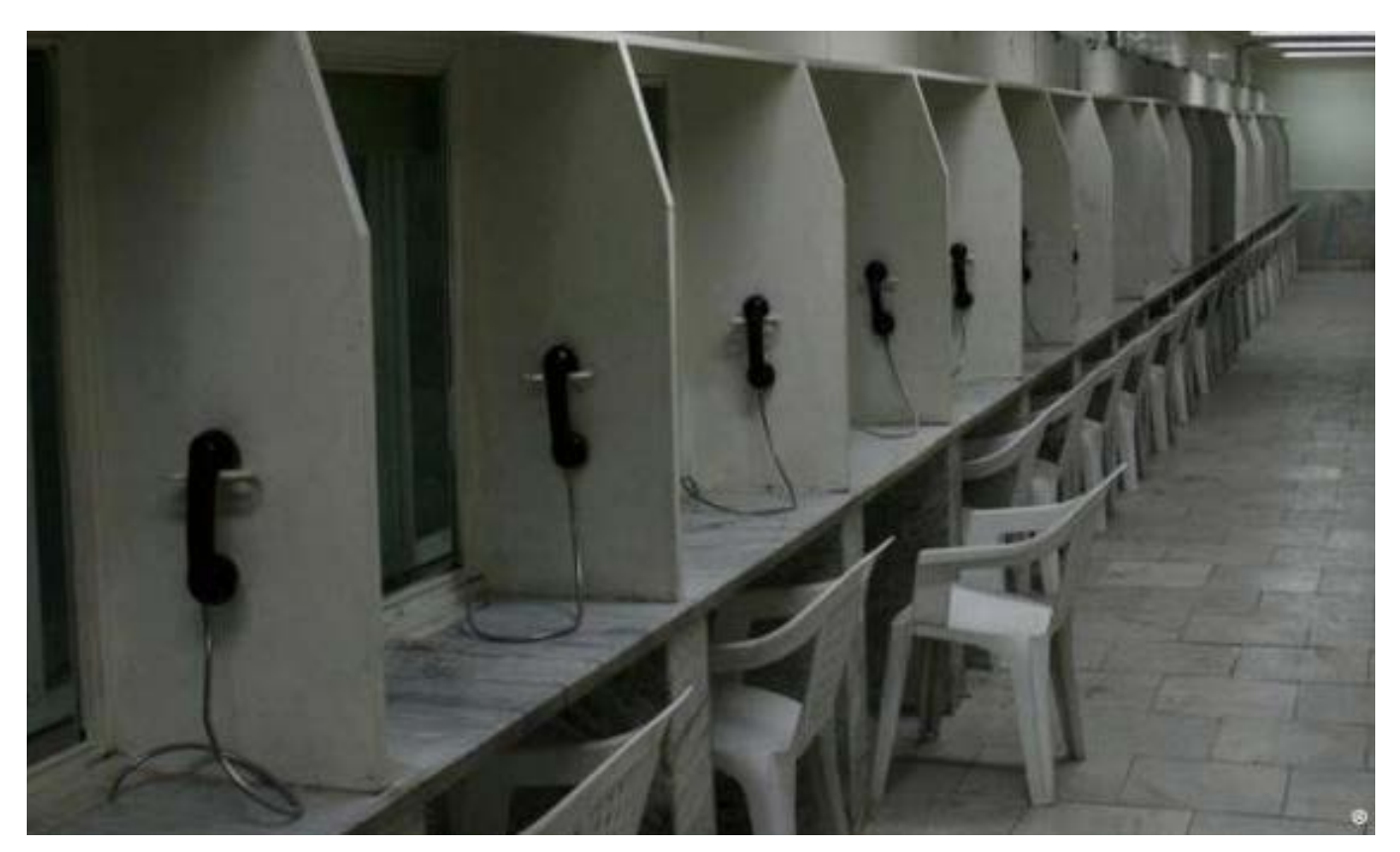
Inmates of the Women's Ward reported that the authorities would often use prisoners' weekly visitation rights as a punitive tool, withholding them as collective punishment.

Indeed, the United Nations explicitly urges the careful consideration of imprisonment of mothers given the unique bond between mother and young child. In Rule 58 of the Bangkok Rules, it states "women offenders shall not be separated from their families and communities without due consideration being given to their backgrounds and family ties. Alternative ways