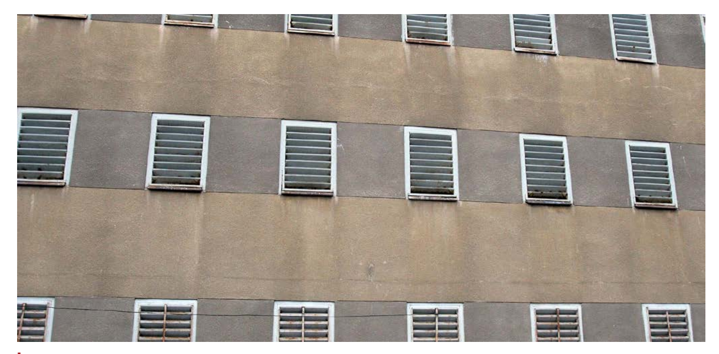
The Women's Ward is variously described by current and former inmates as cramped, relatively windowless, cold and dirty.

Evin Prison's Women's Ward consists of three halls. Two of the halls are 12 square meters and the other is 18 square meters. They are connected by narrow hallways.