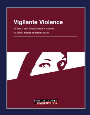
Vigilante Violence: The Acid Attacks against Women in Iran and the State's Assault on Women's Rights