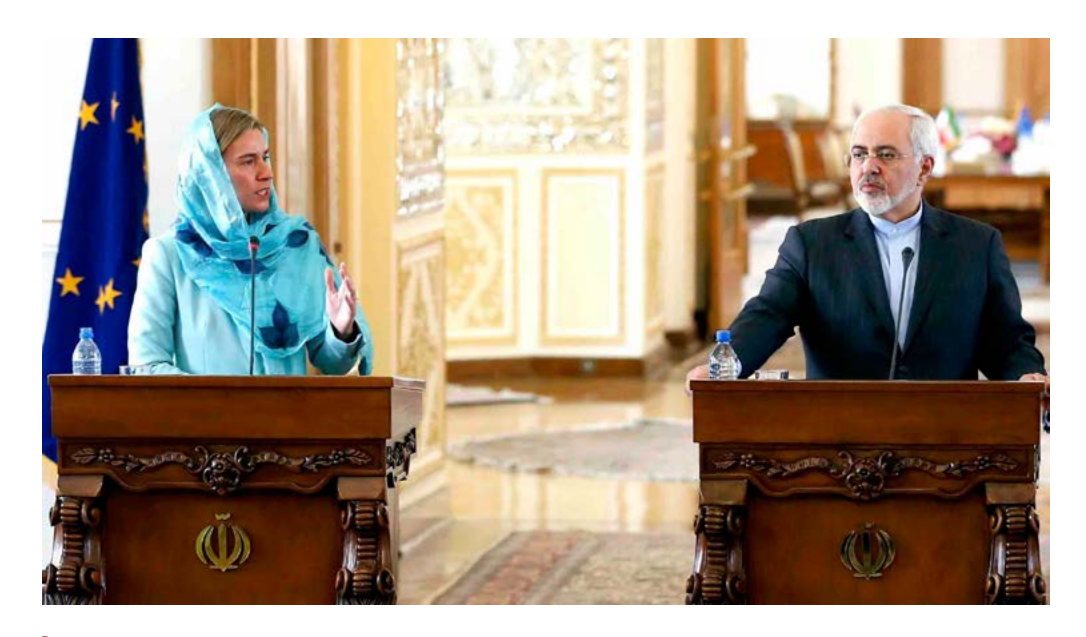
EU Foreign Policy Chief Federica Mogherini and Iranian Foreign Minister Mohammad Javad Zarif