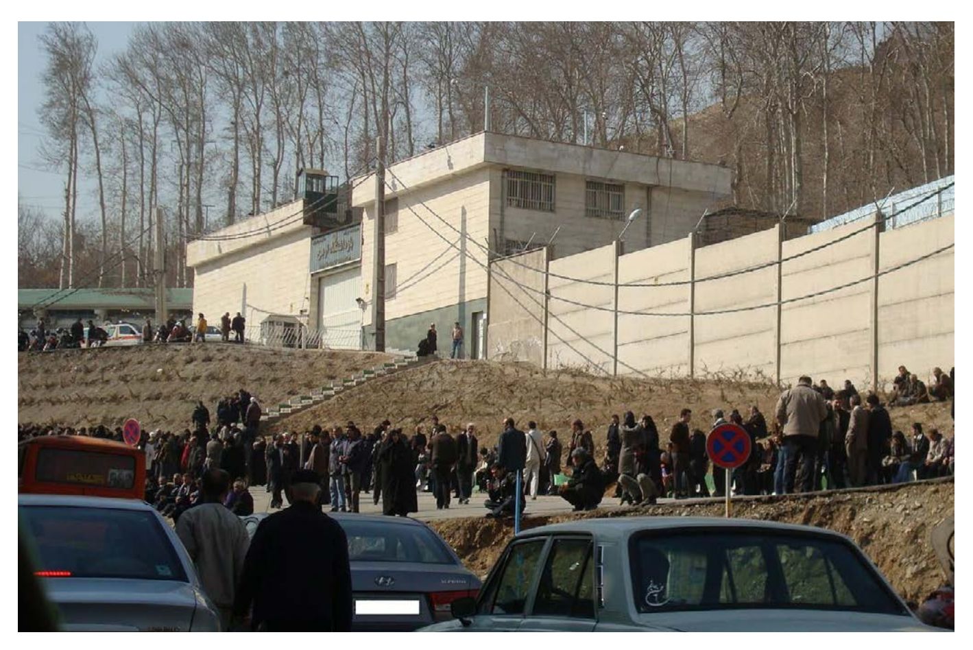
On days that visitors are allowed at Evin Prison, hundreds of family members, including those of the prisoners of the Women's Ward, line up outside the walls.

For the past five years, they have not allowed the inmates in this ward to make phone calls. They don't allow prisoners with children to make calls,