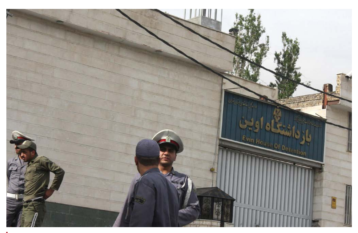
A view of Evin Prison's Main Gate."

All openings and windows towards the courtyard have been blocked. The sun's rays can only get through the windows that are toward Evin hills. But it's not enough, especially for inmates who prefer to stay inside because they are too sick or have bone or back pain and it is hard for them to go up and down the steps to go outside. These inmates develop additional diseases because they don't get enough sunshine. Lack of sunlight has also helped the spread of insects. Last summer the authorities had to disinfect the ward after inmates repeatedly complained about bedbugs.