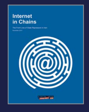
Internet in Chains: The Front Line of State Repression in Iran