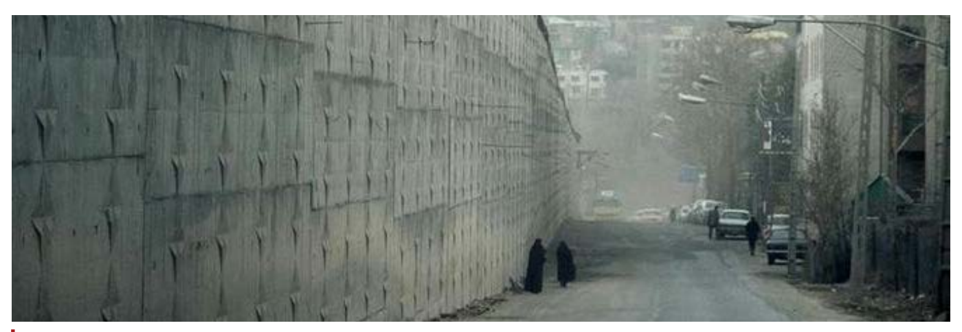
Evin Prison, built in 1972, is situated in northern Tehran.

Since 2005, no United Nations or other international monitoring body has been allowed to visit the Women's Ward at Evin Prison—or indeed any ward at Evin Prison—to observe and report on conditions. This report therefore provides a rare glimpse into the conditions under which political prisoners and prisoners of conscience are kept in the Islamic Republic of Iran.