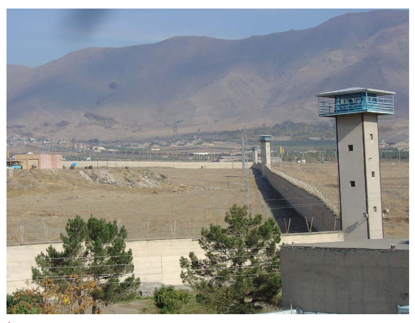
Major issues raised by the prisoners in Evin's Women's Ward included denial of medical care, denied family visits, telephone calls and furlough, inadequate nutrition, insufficient heat, and abusive behavior by guards.